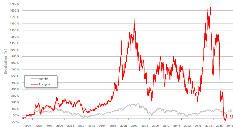
Evolution of the Share Value of Abengoa (compared with Ibex-35)

Since its IPO in the Spanish stock exchange in November 29, 1996, the value of the Company has risen by 37%. The selective IBEX-35 index has risen by 87% during the same period.