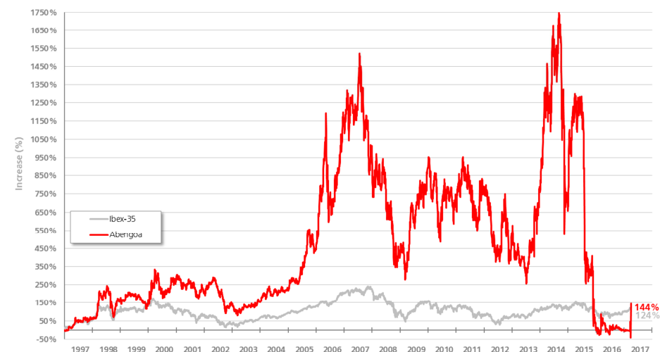
Abengoa's Stock Price Evolution (compared with Ibex-35)

Since its IPO in the Spanish stock exchange in November 29, 1996, the value of the Company has increased by 144%. The selective IBEX-35 index has risen by 124% during the same period.