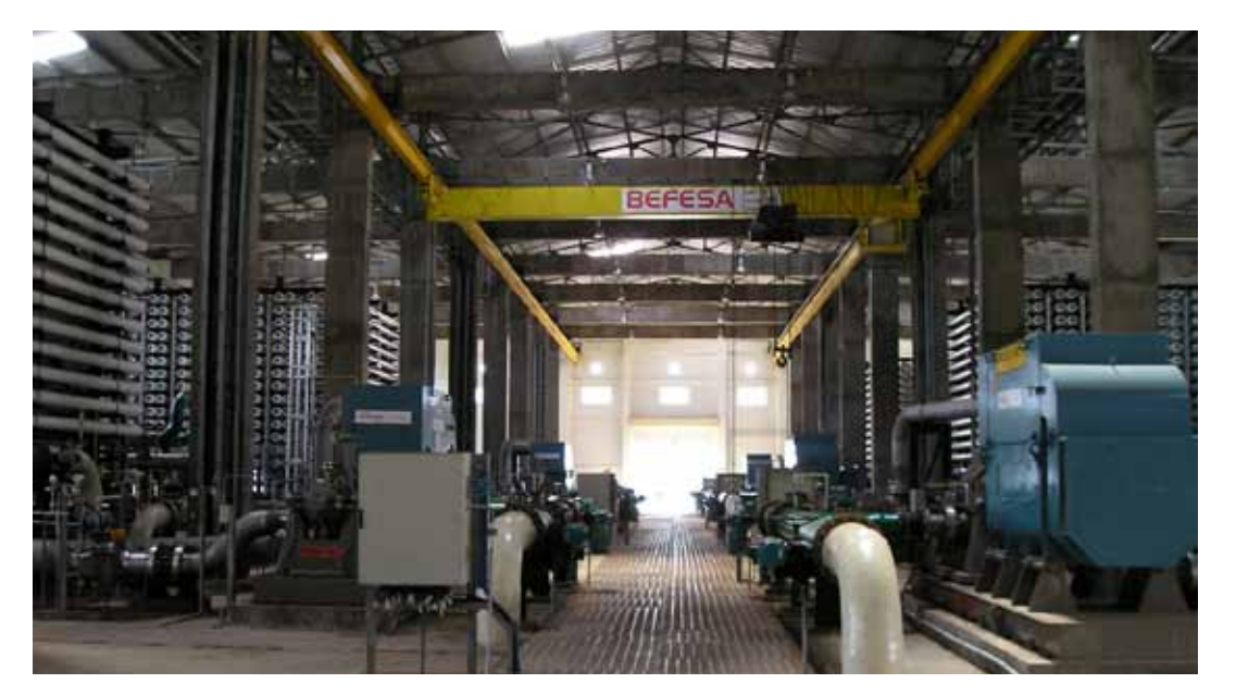
Inside the Chennai desalination plant, India

Befesa has built up a diversified customer portfolio, ranging from both regional and national public bodies to top-tier companies operating in important industries, such as the steel, automotive and chemical sectors. Befesa enjoys long-standing commercial relations with its main customers, thanks to the quality and regular control of its services and also its technological innovation.