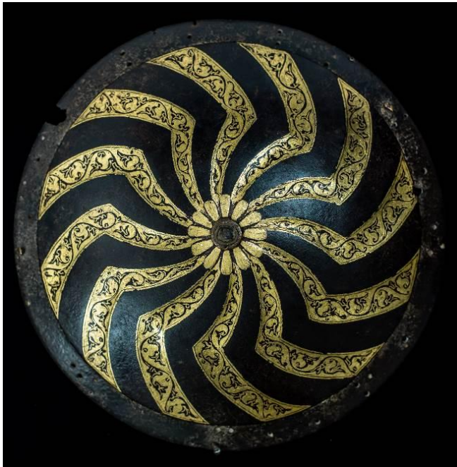
Shield Boss, India or Persia, 17 th Century, Steel and gold, Furusiyya Art Foundation, Liechtenstein

Dallas, TX, March 2014 – From March 30 through June 29, 2014, the Dallas Museum of Art will host Nur: Light in Art and Science from the Islamic World , an exhibition organized by Focus-Abengoa Foundation. The DMA is the U.S. exclusive venue for this international touring exhibition of Islamic art and culture. Critically acclaimed by such publications as The Financial Times and the International New York Times when it premiered in Seville, Spain, in October, Nur: Light in Art and Science from the Islamic World spans more than ten centuries and features 150 works of art and objects from public and private collections in Europe, North Africa, the Middle East, and the United States. The exhibition explores the use and meaning of light as a unifying motif in Islamic art and science worldwide. Organized and developed by Islamic art and culture expert and the DMA's Senior Advisor for Islamic Art Dr. Sabiha Al Khemir, Nur will include a significant number of objects that have never before been presented to the public, from artworks to rare manuscripts and scientific objects.