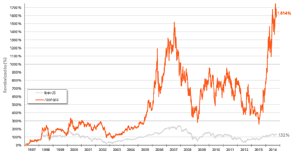
Evolución de la Capitalización de Abengoa en Bolsa (comparado con Ibex-35)