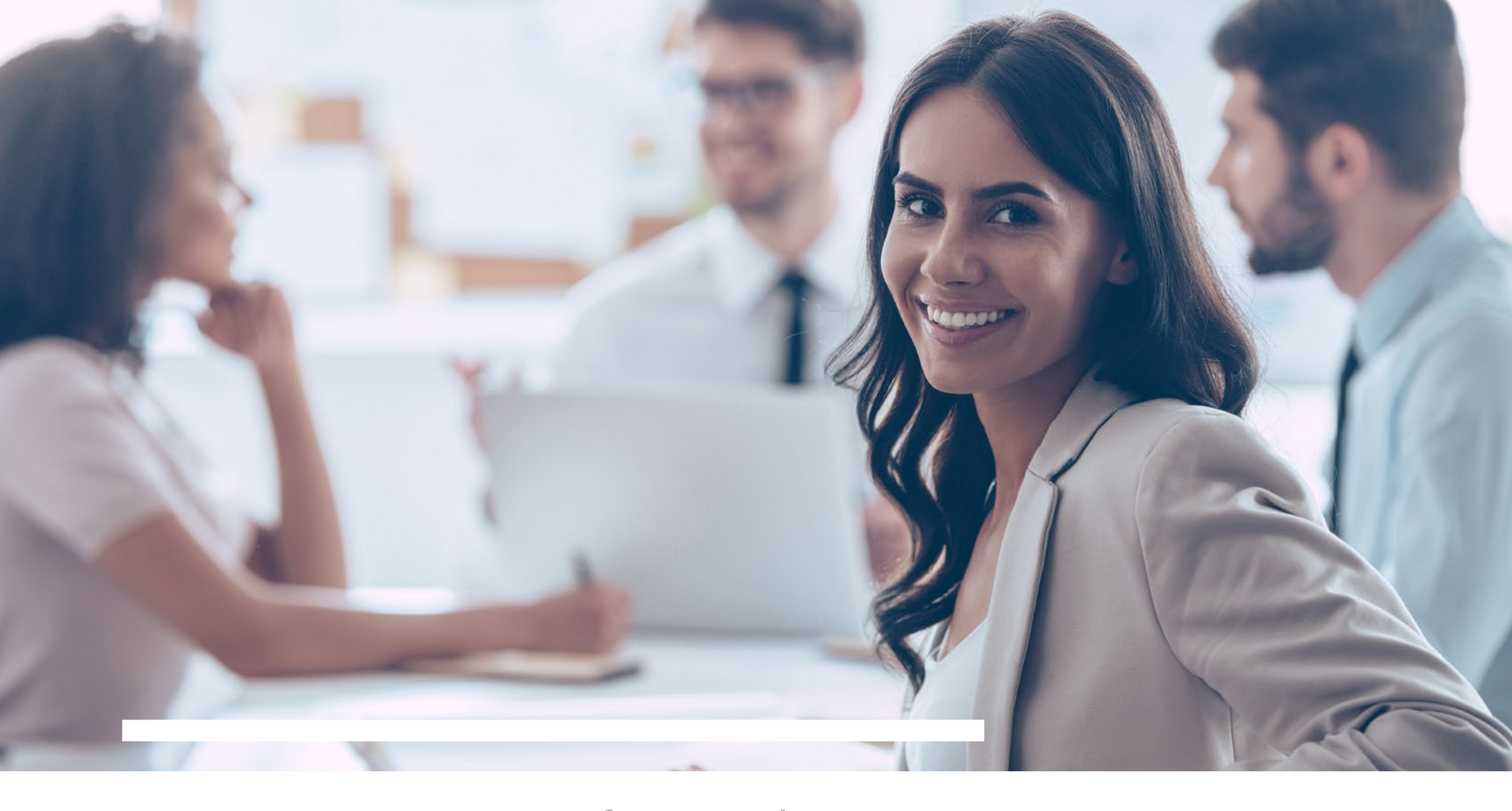
03. Management of capitals