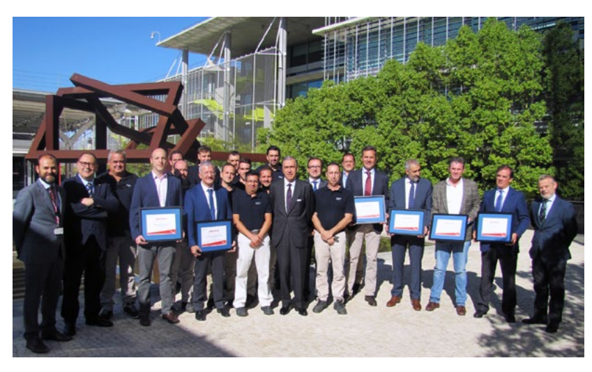
Hosting of the first Health and Safety day at Campus Palmas Altas, Seville.

In addition, every month the company continues to hold its Health and Safety committees directly with the chairman and the main OHS executives, the purpose of which is to monitor and warn about all aspects related to the area, such as the implementation of the necessary Health and Safety measures in each work position and the analysis of accident rates, as well as the follow-up of the goals set for each of the subjects dealt with. 403-1