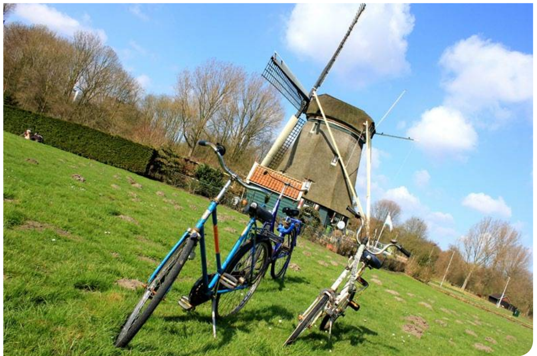
for the fifth edition of the photography competition on sustainable development.

One of the organization's main objectives in relation to suppliers is the responsible management of the supply chain, extending the company's principles and values throughout the chain. To achieve this the company establishes, among other things, the obligation to sign the Code of Corporate Social Responsibility (CSR) and to report Greenhouse Gas Emissions (GHG) related to supplies, while offering ongoing training in different areas related to work risk prevention, environmental management and respect for human rights, (HR).