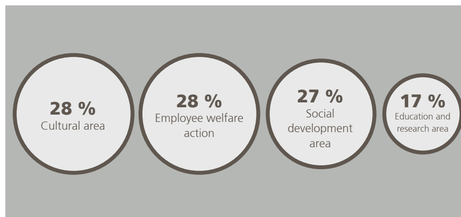
Percentage distribution of total economic investment in community action in 2011